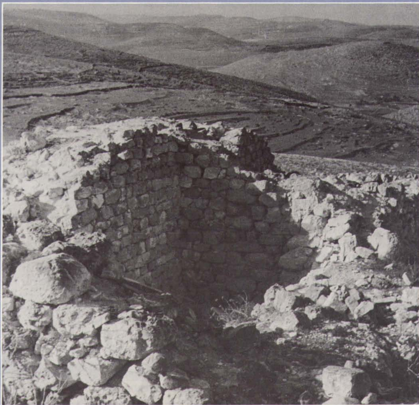
Saul Becomes King of Israel