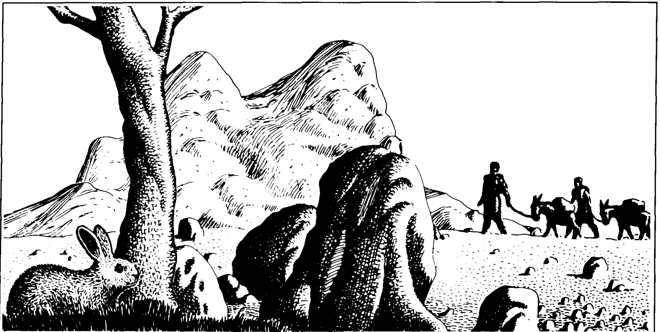
Saul and a servant search for his father's donkeys.