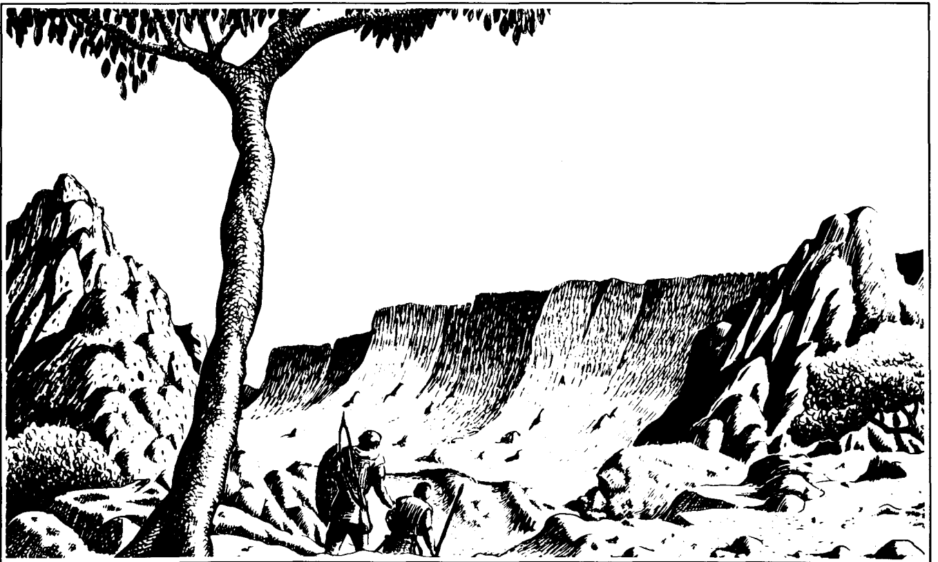
Jonathan and his armorbearer secretly cross the valley to the Philistine camp.