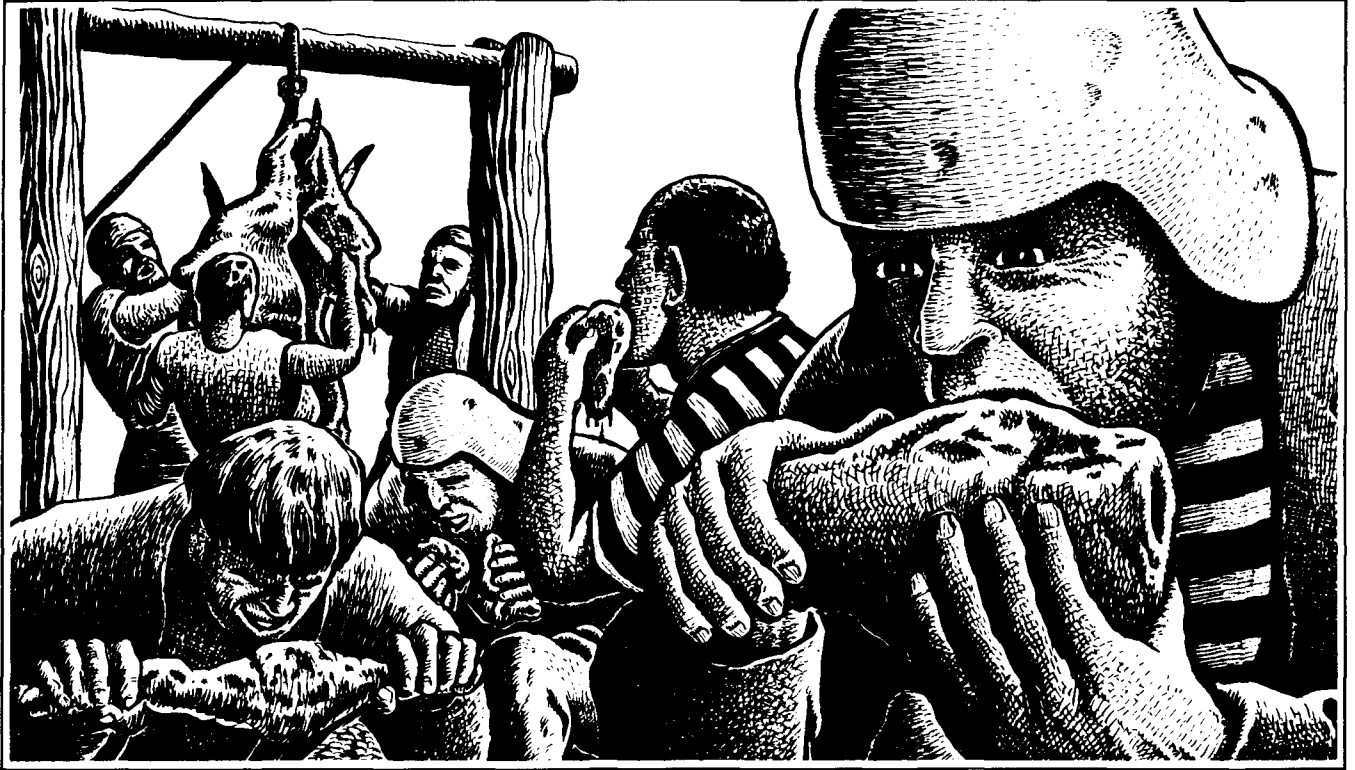
Saul's men hastily gorge themselves on the raw meat of the butchered animals.