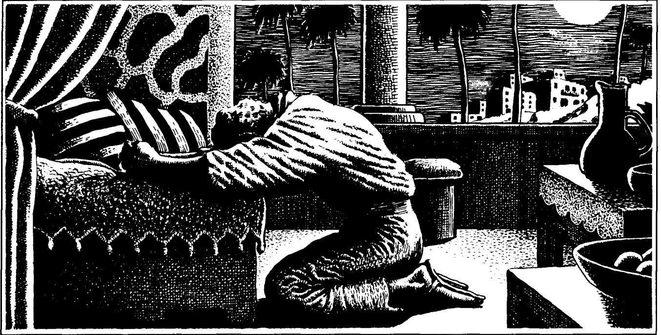
Samuel prayed all night after learning that God no longer wanted Saul to be king of Israel.